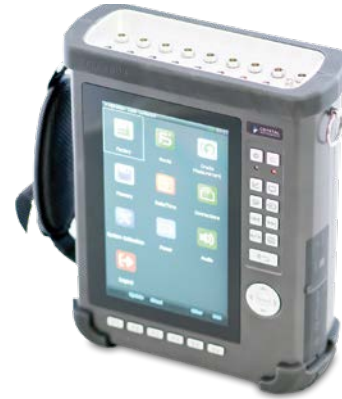
CoCo-90X 16 Channel Handheld Dynamic Signal Analyzer