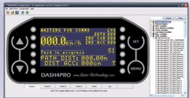
Configuration software with DBC file loading and fully configurable display layouts

When used as a standalone CAN display the DASH4PRO can be quickly configured to display any combination of data from an industry standard DBC file. The data can be displayed over 5 screens, in different sized fonts, or displayed on barcharts or graphs. There are also more advanced options like maths channels, alarms, and the ability to output CAN commands.