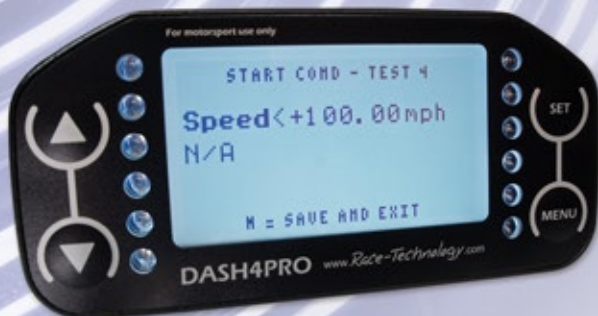
Configuring SPEEDBOX triggered tests using the DASH4PRO display

The display is very compact, and can be permanently fitted, or simply mounted using a windscreen suction mount in the vehicle. It is available with 2 screen technologies, either OLED or LCD depending on the application.