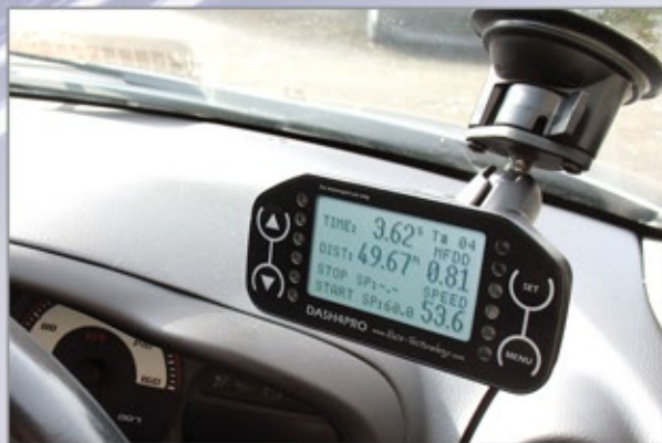
Secure temporary mounting with suction mounting kit